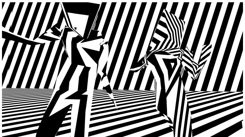
Fig. 4 MAN A VR in-world screen grab of dancing figures (2015), Gibson / Martelli.

From this first version, a form of AR, the project developed into a room scale VR experience for the HTC VIVE and later for the Oculus Rift (Fig. 4). The MAN A VR experience is composed of seven scenes, all strikingly black and white, with a visual debt to camouflage painting techniques such as Dazzle, or “Razzle Dazzle,” used on battleships in World War I (Dazzle Ships, Fig. 5). The shift from the Cardboard AR version of the headset with devices inserted into it, where the user was unable to move with the figures, to the VIVE version, where the user has freedom of movement in a space of 5 square metres, is profound. What started as an immersive but basically static viewing experience was transformed into one where, even though there is no interaction per se, the user can move amongst the performers and insert themselves into the virtual space, an infinite space where the laws of gravity don’t exist.