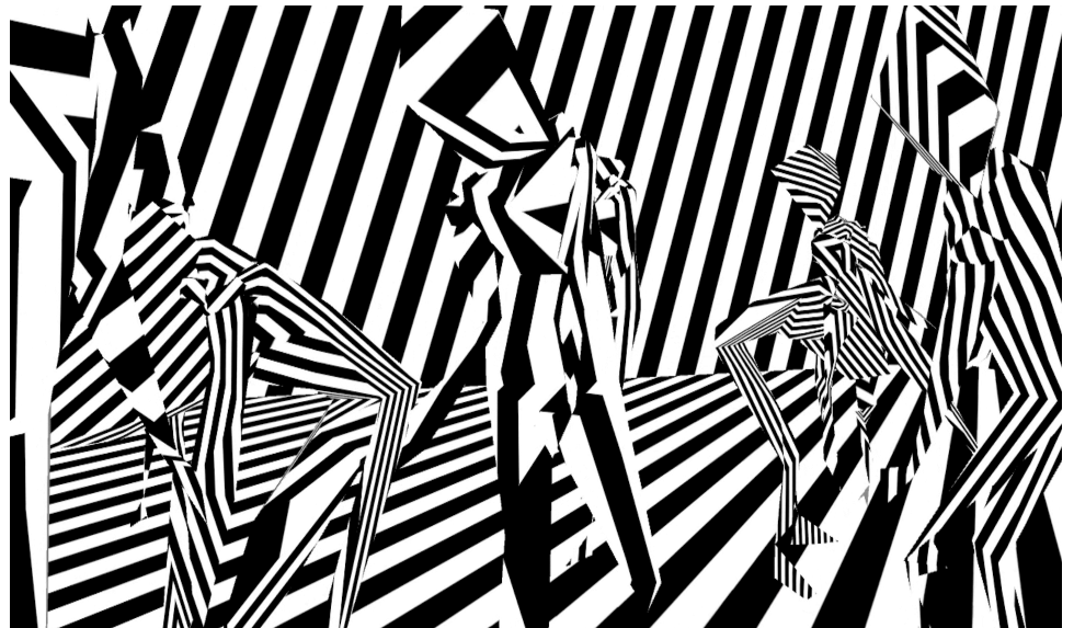
Fig. 1 MAN A VR in-world screen grab of dancing figures (2015), Gibson / Martelli.

In MAN A VR wearing the HTC VIVE she walks through the dancers, witnessing their playful whimsy and is taken wholly by surprise by the dynamics and certain shifts of movement and configurations and abstract forms for her (Fig.1). She runs straight into the wall on her first experience as the (in)visible boundary of the VR space. Was she taken by the not-so-limitless void to ride the energy of the dance? Or did she just want to ignore the blue mesh wall which creates the volume, mapping out the edge of the VR Volume? This was echoed afterwards when the glass door of the restaurant had a little hitch, a give, a force on opening, it was unpredicted as if a ghost had pulled it from the other side. We both noticed it and we giggled.