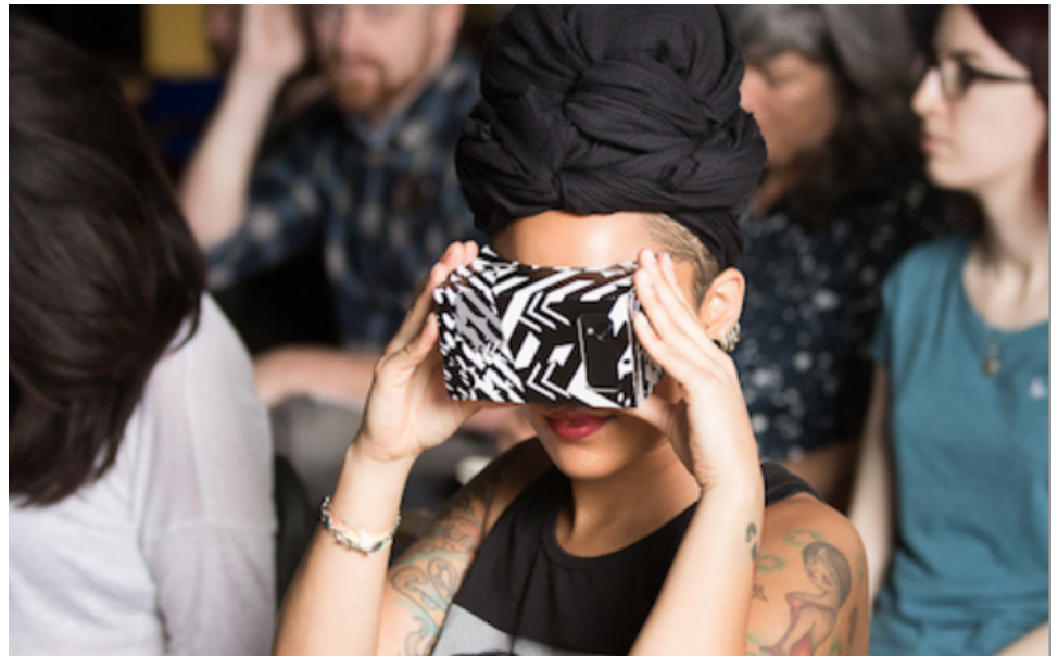
Fig. 2 MAN A for Google Cardboard, photo from Collusion talk (2017), credit Claire Haigh.

MAN A was originally created for the Google Cardboard, a low cost headset made of stiff paper with mobile phones slotted into it (Fig. 2 and 3). The phone's sensors captured head rotation, while the screen displayed a split stereo view for the headset lenses.